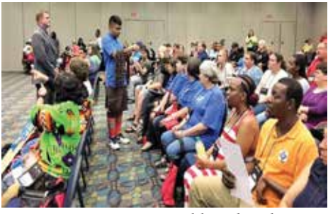
VOICES giving out necklace beads donated by Rota Mayor's Office.