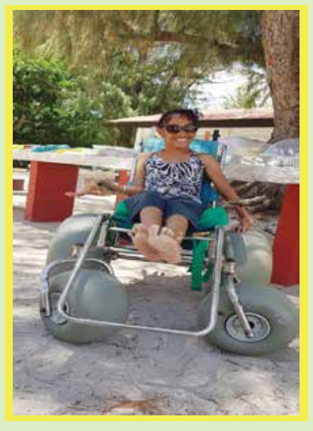
Thank you to Assistive Technology Center at DDC for the loan of the w/c that went to Managaha for water surfing.