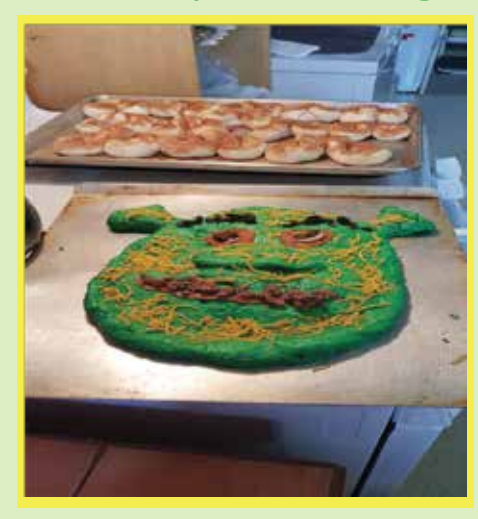
With a little green food coloring, pepperoni, cheese and hamburger, we made Shrek pizza. Our smiles were bigger than Shrek. Our cinnamon sugar pretzels were mouth-watering.