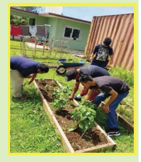
CLI has its very own plantation