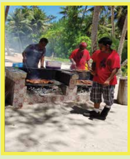
Another day of fun in the sun at Managaha and not to forget the barbeque