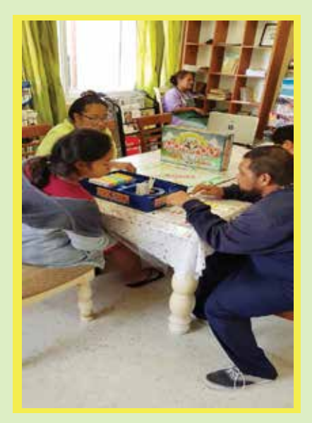
Fun and games at the Center