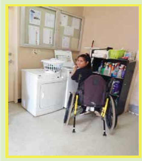
Using our new washing machine on Laundry day at CLI