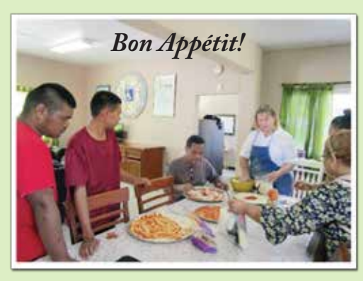
Here we are learning how to make homemade pizza from scratch. We baked them in our new gas oven!