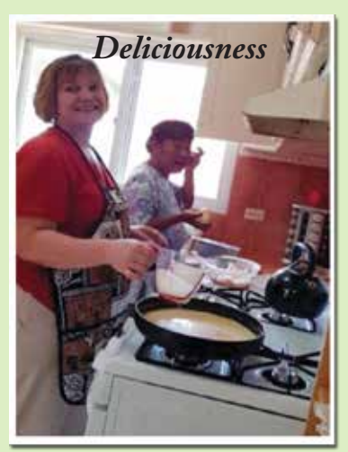
Cooking some goodness using our new gas stove! Thank you to T Galleria!