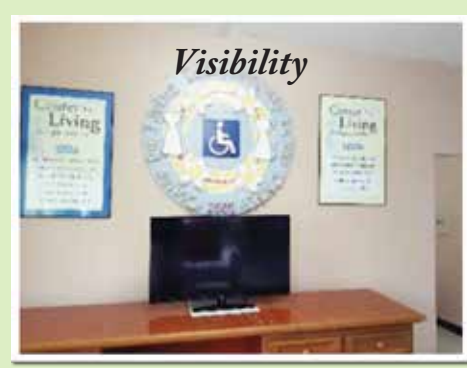
CLI received this brand new T.V. courtesy of T Galleria. Thank you!