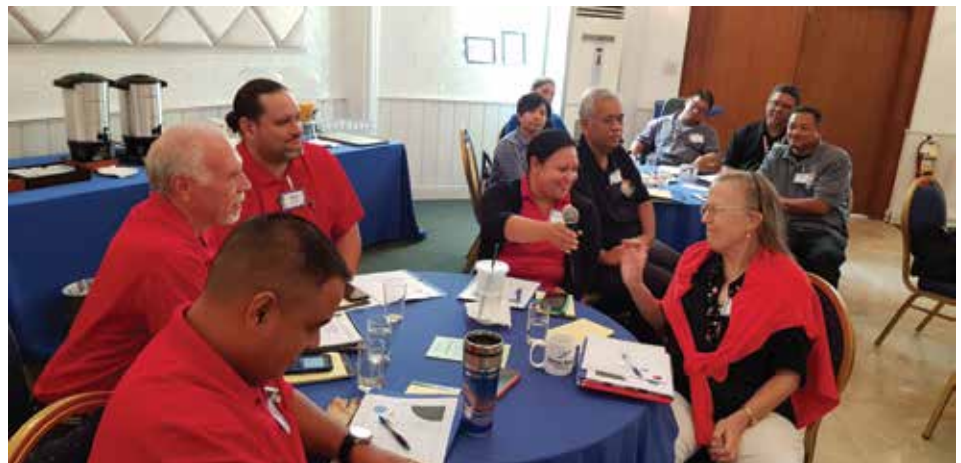
Representatives from the Northern Marianas College (NMC) and Commonwealth Office of Transit Authority (COTA) at NMC-UCEDD's "Program Assessment and Evaluation" training workshop